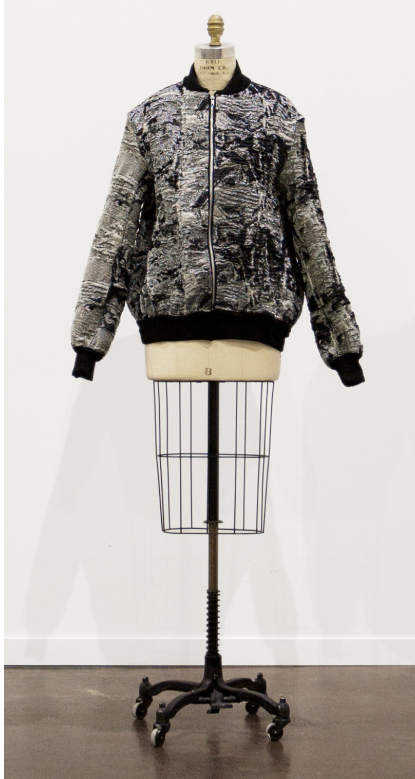
Emergency Blanket Bomber Jacket - Jacquard woven metallic thread and wool