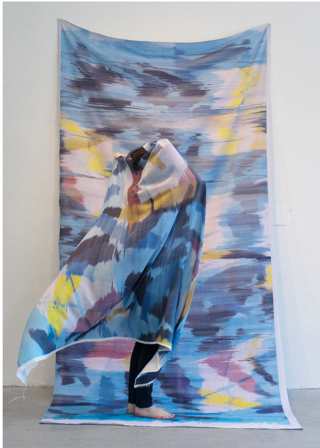
Length for garment- Digitally printed acid dye on silk satin twill