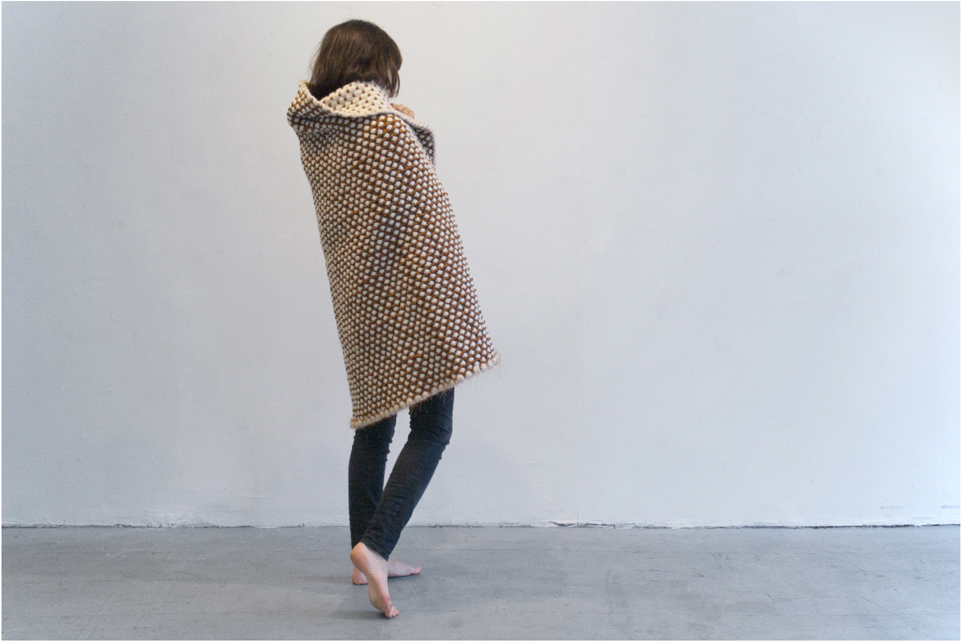
Security Blanket - Jacquard woven copper and wool