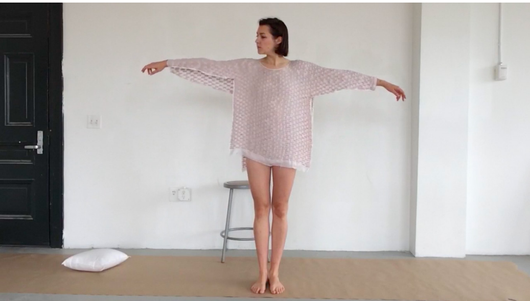
Video Documentation- Still