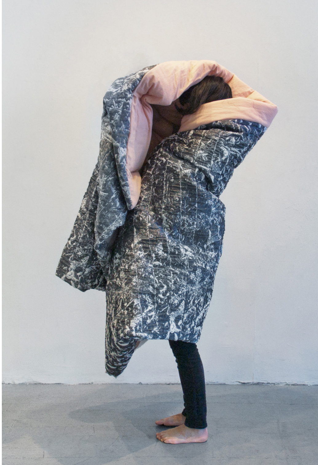
Cozy Emergency Blanket - Jacquard woven wool and metallic thread, cotton flannel, cotton batting