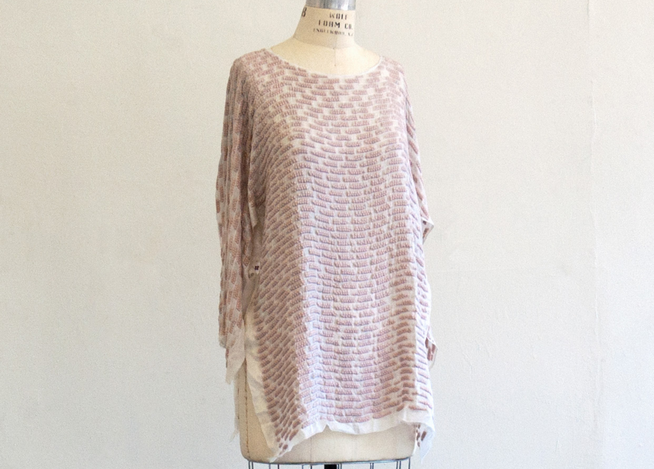
Weighted Silk (16 lbs)- Silk Organza, Copper BBs, Polyester thread