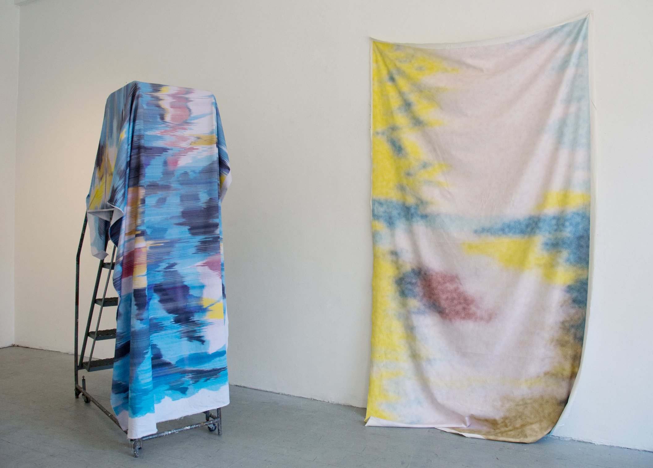
Lengths for Interior Decoration and Furnishing —Digitally printed fiber reactive dye on cotton twill.